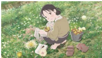
『In This Corner of the World』