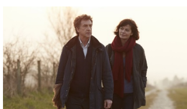
“Irreplaceable” Dir.: Thomas Lilti <2016/France/102min.>