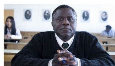
“The Citizen” Dir.: Roland Vranik <2016/Hungary/109min.>