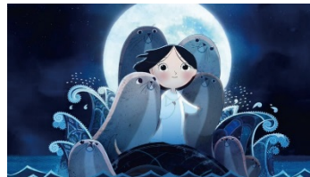
『Song of the Sea (Dubbed in Japanese)』