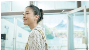
『Her Love Boils Bathwater』

In addition, animated masterpiece, "In This Corner of the World", which went on to become a big box-office success after its theatrical release in November, and "Song of the Sea", which received recognition from the Agency for Cultural Affairs, are featured in the "Animation Screening".